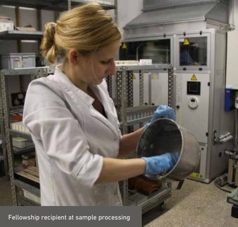
Fellowship recipient at sample processing