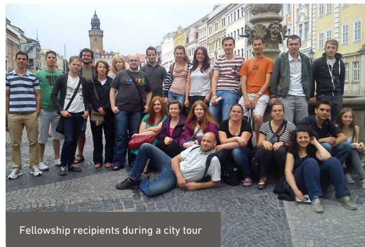
Fellowship recipients during a city tour