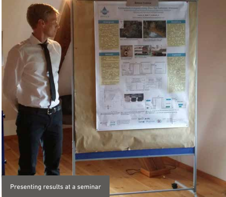
Presenting results at a seminar