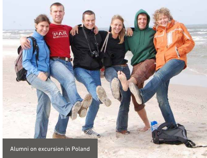
Alumni on excursion in Poland