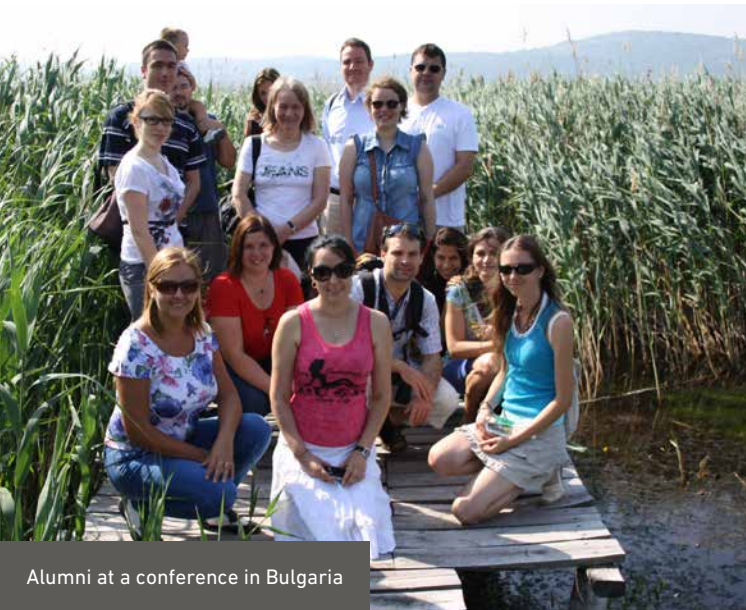
Alumni at a conference in Bulgaria

No work permit is needed for the fellowship stay in Germany. For the right of entry into Germany, however, some states require a visa. Fellowship recipients must apply for visa themselves in their native countries.